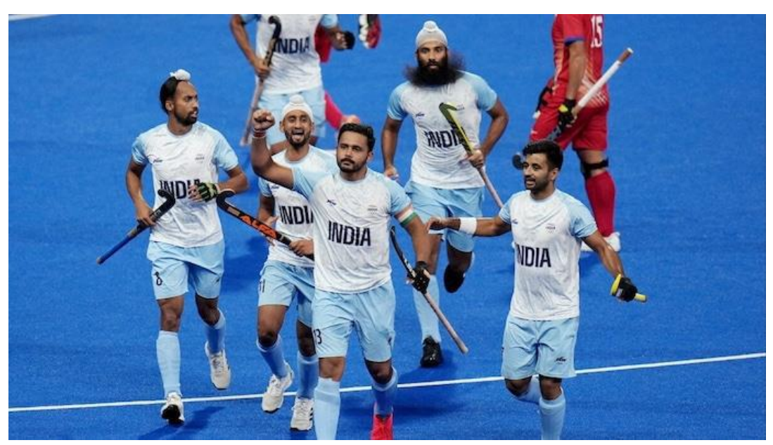
Picture caption: Indian Men's Hockey team, comprising nine LPU students, emerged victorious in the 19th Asian Games.

What sets LPU apart is not just its dominance at the national level but its global impact as well. The university's athletes have proudly represented their alma mater on the international stage, showcasing the institution's commitment to developing talents that transcend geographical boundaries.