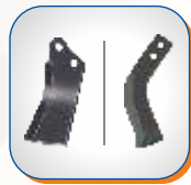
AVAILABLE WITH L&J TYPE BORON STEEL BLADES