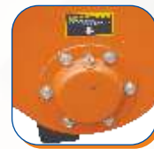
OIL IMMERSED SIDE BEARING