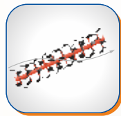
HELICAL ARRANGEMENTS OF BLADES