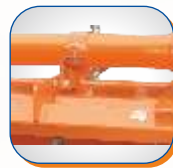
ROBUST STRUCTURE FOR HEAVY VIBRATION FREE FILED OPERATION