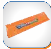
HEAVY DUTY Z TYPE TRAILING BOARD