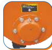
OIL IMMERSSED SIDE BEARING