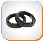
DU CONE MECHANICAL OIL SEALS

*The Product & Specifications are subject to change/discontinue without any notice on the sole discretion of manufacturer.