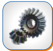
BIGGER & STRONG CROWN & PINION