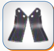
AVAILABLE WITH L&C TYPE BORON STEEL BLADES