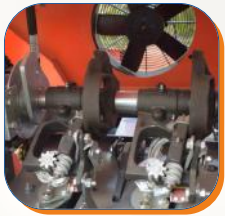
RASSPE DESIGN HD KNOTTER