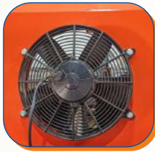
REVERSIBLE KNOTTER FAN