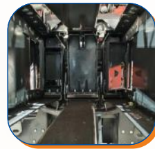
AIR IS DRAWN IN FROM THE FRONT, FLOW ACROSS THE KNOTTER