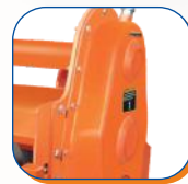
OIL IMMERSED SIDE BEARING