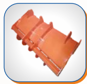
ROBUST STRUCTURE FOR HEAVY VIBRATION FREE FIELD OPERATION