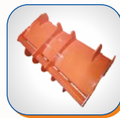
ROBUST STRUCTURE FOR HEAVY VIBRATION FREE FIELD OPERATION