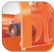
STRONG GEAR BOX