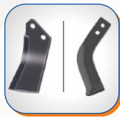
AVAILABLE WITH L&J TYPE BORON STEEL BLADES