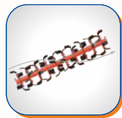
HELICAL ARRANGEMENTS OF BLADES