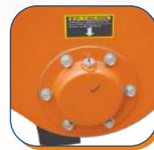
OIL IMMERSED SIDE BEARING