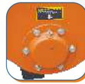
OIL IMMERSED SIDE BEARING