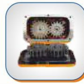
FOUR SPEED GEAR BOX