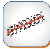
HELICAL ARRANGEMENTS OF BLADES