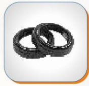
DUO CONE MECHANICAL OIL SEALS