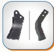
AVAILABLE WITH L&J TYPE BORON STEEL BLADES