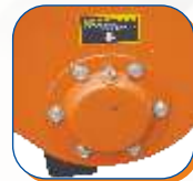
OIL IMMERSSED SIDE BEARING