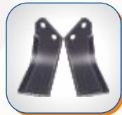
AVAILABLE WITH L&C TYPE BORON STEEL BLADES